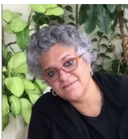
Izabella Teixeira Former Minister of Environment of Brazil