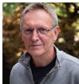
Janez Potočnik Former European Commissioner for the Environment