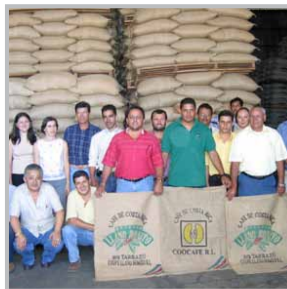
Coocafe, a coffee cooperative enterprise, in Costa Rica, bringing fair trade coffee to the market.

The site-specific and generic indicators and data examples do not constitute a complete list of the best indicators to use in a study. Other indicators might be more appropriate to use depending of the context. The resource aims at guiding towards relevant sources and proposing a few metrics