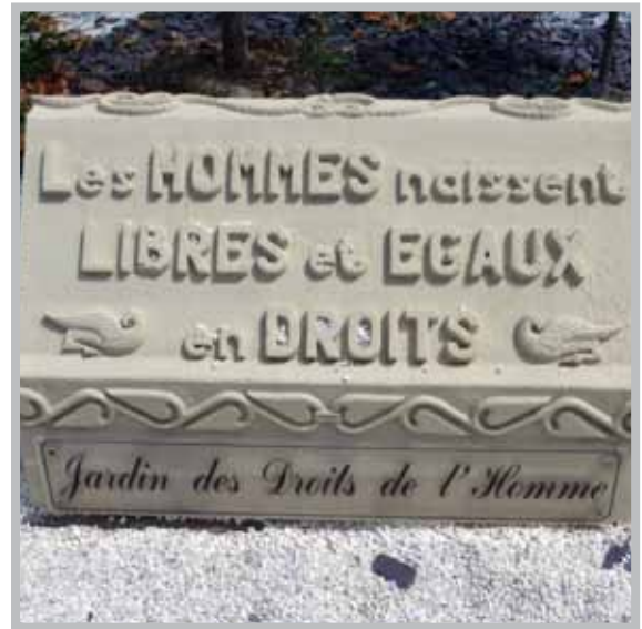
A sculpture in the 'Jardin des Droits de l'Homme' (Aiguillon, France) cites the first article of the Universal Declaration of Human Rights.