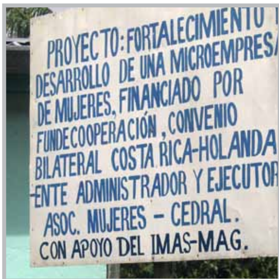
The entrance of a microenterprise established to empower women in rural Costa Rica.

In relation to the methodological sheets, these all are critical aspects for the sheets in their current state and as they evolve. It is foreseen that future versions of the sheets will provide further guidance on Life Cycle Impact Assessment.